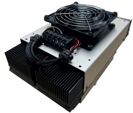
Product photo (warm side)