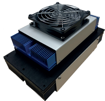
Product photo (cold side)