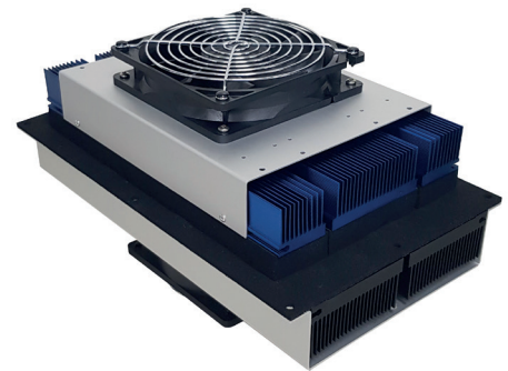
Product photo (cold side)