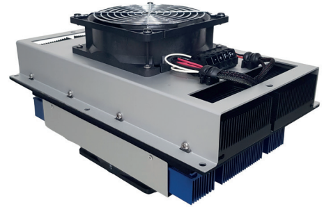
Product photo (warm side)

Air-to-Air thermoelectric assemblies are used to cool (or heat) the inside of cabinets or enclosures. Heat dissipated by electronics or other equipment will be pumped out of the cabinet and will be discharged to the environment. Because no refrigerant liquid (CFC's) is used, the assemblies are friendly for our environment. Our coolers operate 100% on a DC-voltage. They are ready to use. The installation is easy by making an opening in the cabinet, move the cold (blue) side of the assembly from the outside into the hole and use screws to fix it. When it is expected to reach the dew point (100% R.H.) inside the cabinet, you need to mount the assembly in a vertical position to allow moisture on the cold side heat sink to drip down between the ribs. Stainless steel collection gutters are available to drain the moisture and to prevent damaging equipment. Our standard coolers are designed for indoor use. Waterproof versions are available as well. Because we design and build our coolers in-house, we are able to build special versions quickly. Please ask for the possibilities.