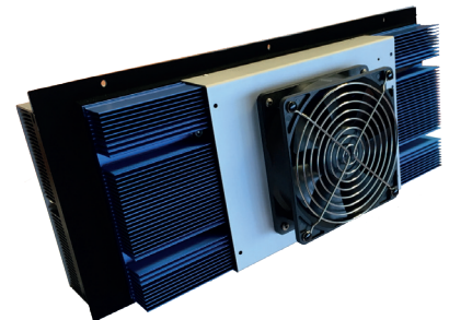
Product photo (cold side)