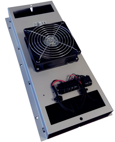
Product photo (warm side)